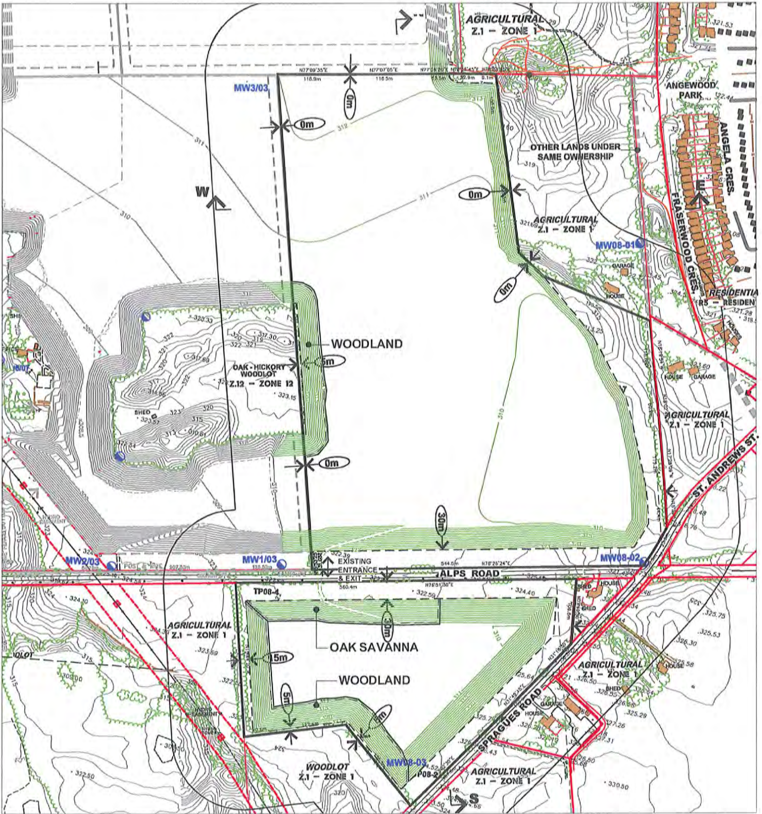
Figure 4 REHABILITATION PLAN